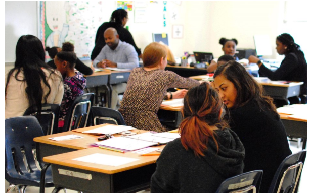
Volunteers use Heart's tutor-friendly curriculum and are supported by an on-site coordinator.

Ensure that all elementary students develop the strong foundation in math and enthusiasm for academics needed for long-term success, by helping schools use volunteers as tutors.